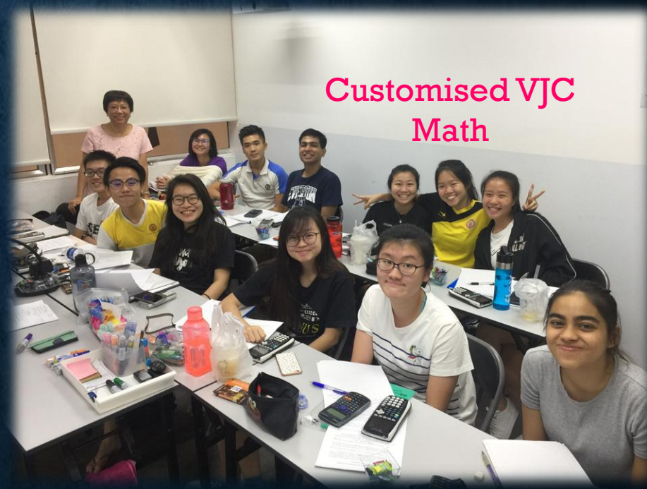
Customised VJC Math